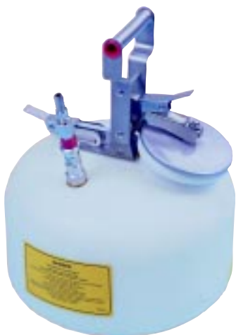
SAFETY CANS & CABINETS