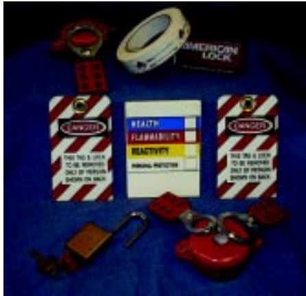
LOCKOUT / TAGOUT